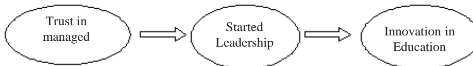
Fig. 1. Research model and hypothesis

The participants in this study consist of 331 randomly selected teachers who worked in primary and secondary schools in Kahramanmaraş in the academic year of 2012-2013. The sample of the study is comprised of 331 teachers of which 137 were female (41.4 %) and 194 were male (58.6 %). 297 of them have a license degree (89.7 %), 25 of them have master degree (7.6 %) and just