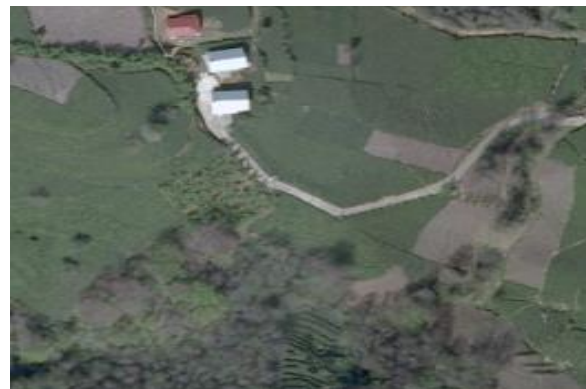
Fig. 1. A small portion of a sample image used in this work

Rize province, where tea plants are grown extensively, was chosen as the study area. Studies have been carried out on 5 multi-spectral images, approximately 7164x9360 in size, obtained by remote image sensing systems. The images were taken using airborne UltraCam-X digital aerial camera with 30 cm ground sample distance (GSD). These data were obtained EMI Group Inc. The images shows that there are dense tea areas, other trees, uncultivated bare areas, roads and buildings (Fig. 1).