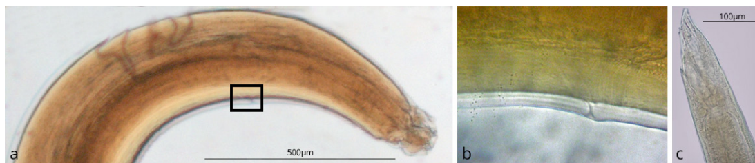
Figure 1. Hysterothylacium sp. a) Nerve ring, with square indicating the excretory pore; b) excretory pore (40× magnification); c) caudal end of Hysterothylacium sp.