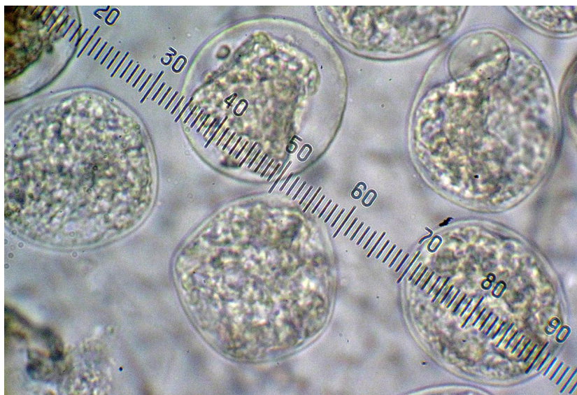
Figure 2. Hysterothylacium sp. eggs (40× magnification).

nerve ring level. The excretory canal of the third-stage larva was 396.0 µm, the intestinal appendix was 210 µm long, and the spine tail was 18 µm long.